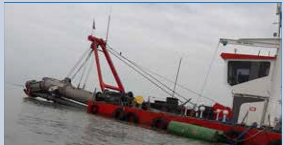
Picture: Cutting Dredger-2