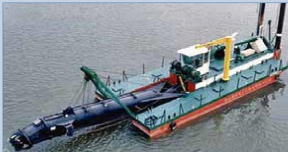
Picture: Cutting Dredger-1