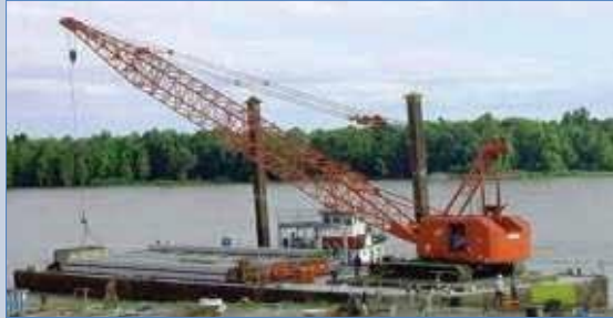
Picture: Barge Mounted Crane (35 T)