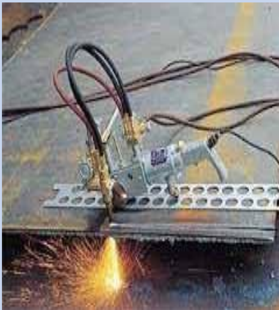
Gas Cutter (semi-auto)