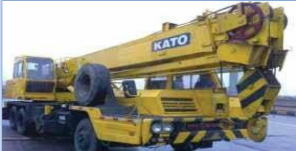
Hydraulic Crane (25 Ton)