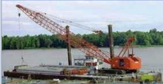
Picture: Barge Mounted Crane (35 T)