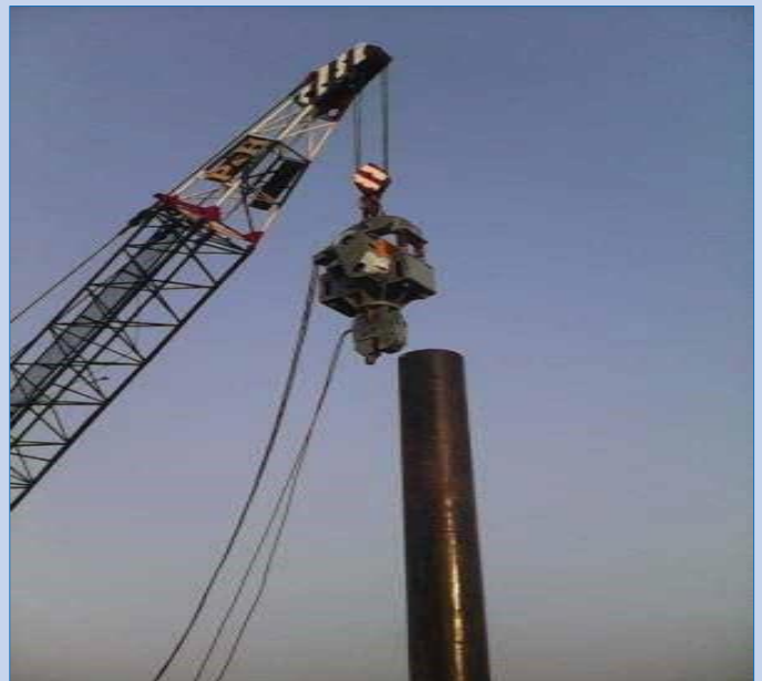
Pipe Driving by Vibro Hammer