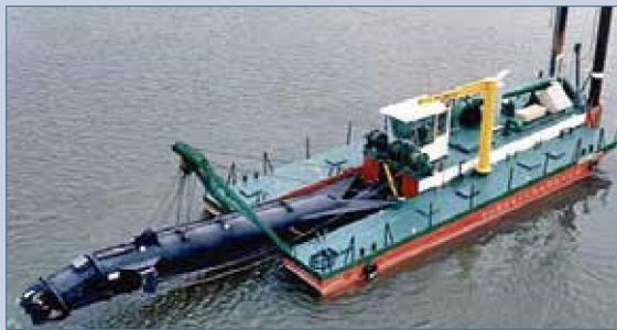
Picture: Cutting Dredger-1