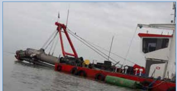
Picture: Cutting Dredger-2